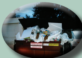
Examples of containers that are so overloaded they are not serviceable.