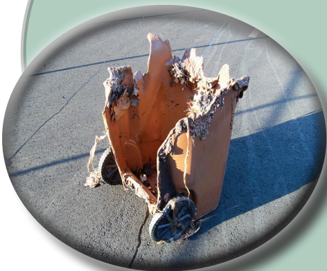
Result of hot ashes being placed in the yardwaste cart